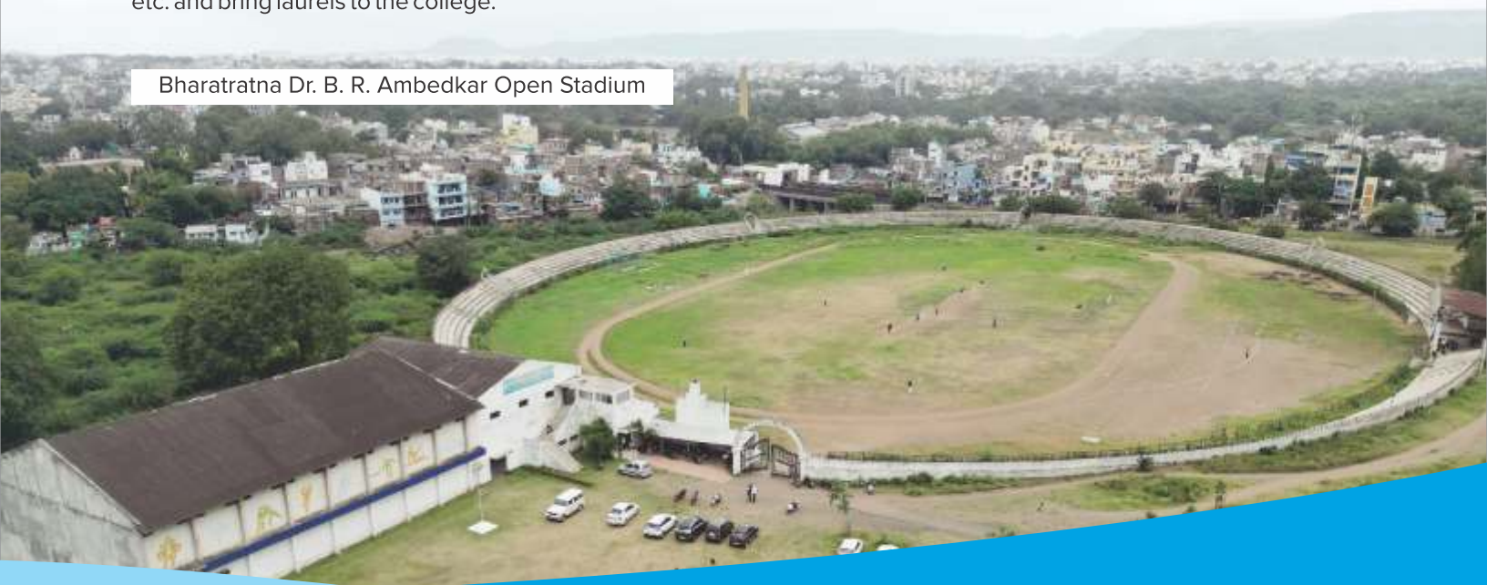
Bharatratna Dr. B. R. Ambedkar Open Stadium

Students enthusiastically participate in intra college, inter-university, state and national level games like Boxing, Kabbadi, Hockey, Volleyball, Kho-Kho, Table Tennis, judo, wrestling, Handball, Taekwondo, Badminton and athletics etc. and bring laurels to the college.