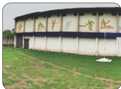
Samrat Asoka Gymnasium Hall

In campus Four Hostel buildings comprises forty-eight (48) rooms with all modern facilities and sanitary blocks. Each hostel is proposed to accommodate about 144 hostlers separate 35 rooms available in Ashwaghosh boys hostel for our students.