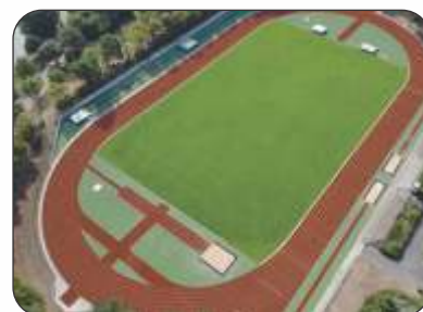
400 Mrt. Standard Track